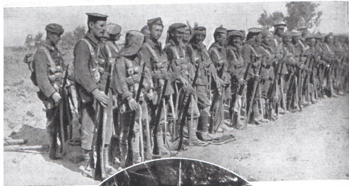
atoon of the Drake ttn. R.N.D. in a sunken id in '15, ready to go ward to the Helles nches.