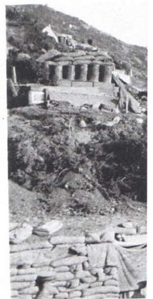
Below, Anzac Cove as it w 1915—dug-outs, ammuni stores and general activity.