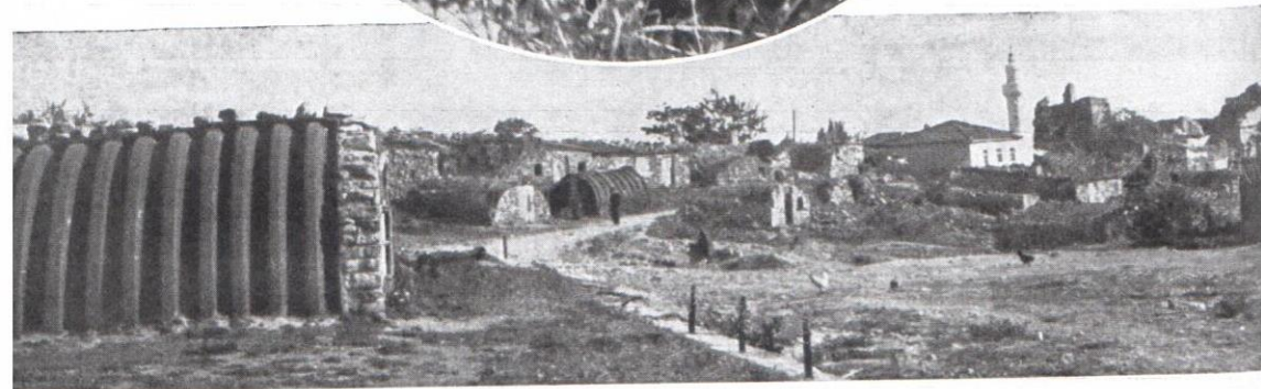
The village of Sedd-el-Bahr to-day, where the French elephant-iron roofing is appreciated by Turkish peasants. A new mosque and minaret are conspicuous among the old battered dwellings.